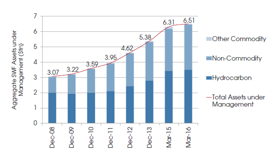
Figure 1: Global Sovereign Wealth Fund AUM (USD tn)<sup>39</sup>

Figure 2 shows the AUM attributable to the top 10 SWFs in the first half of 2015 and the first half of 2016. We find that the top 10 SWFs control approximately 78% of total SWF AUM as of the first half of 2016.